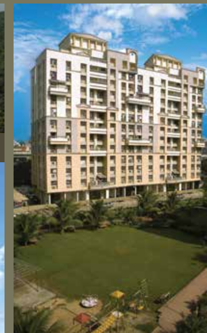
Prestige Garden, Thane