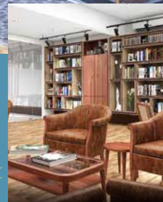
Library with Reading Lounge