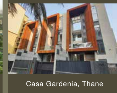
Casa Gardenia, Thane