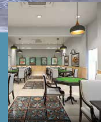
Card & Chess Room