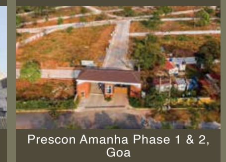
Prescon Amanha Phase 1 & 2, Goa