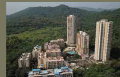
Prestige Residency, Thane

We have an impeccable record of completing projects on time earning us tremendous goodwill in all the markets we're present in.