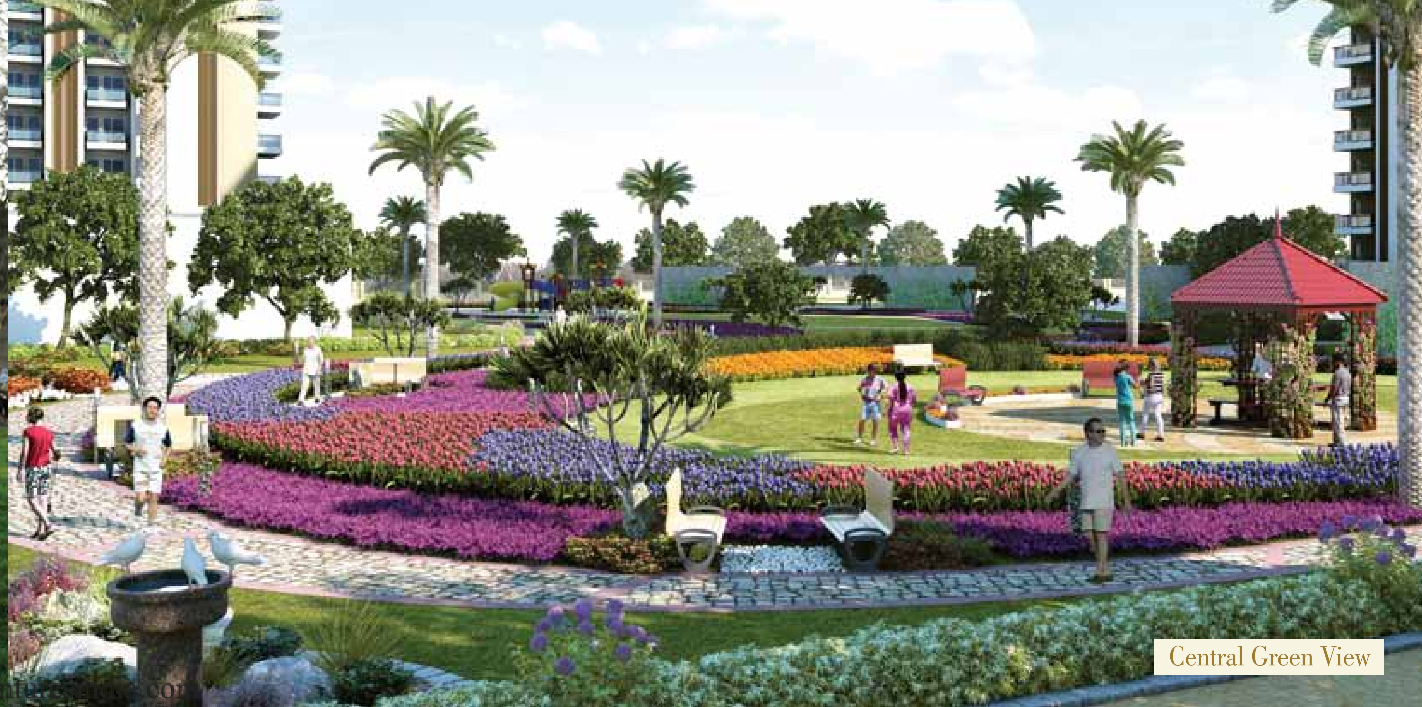
Central Green View